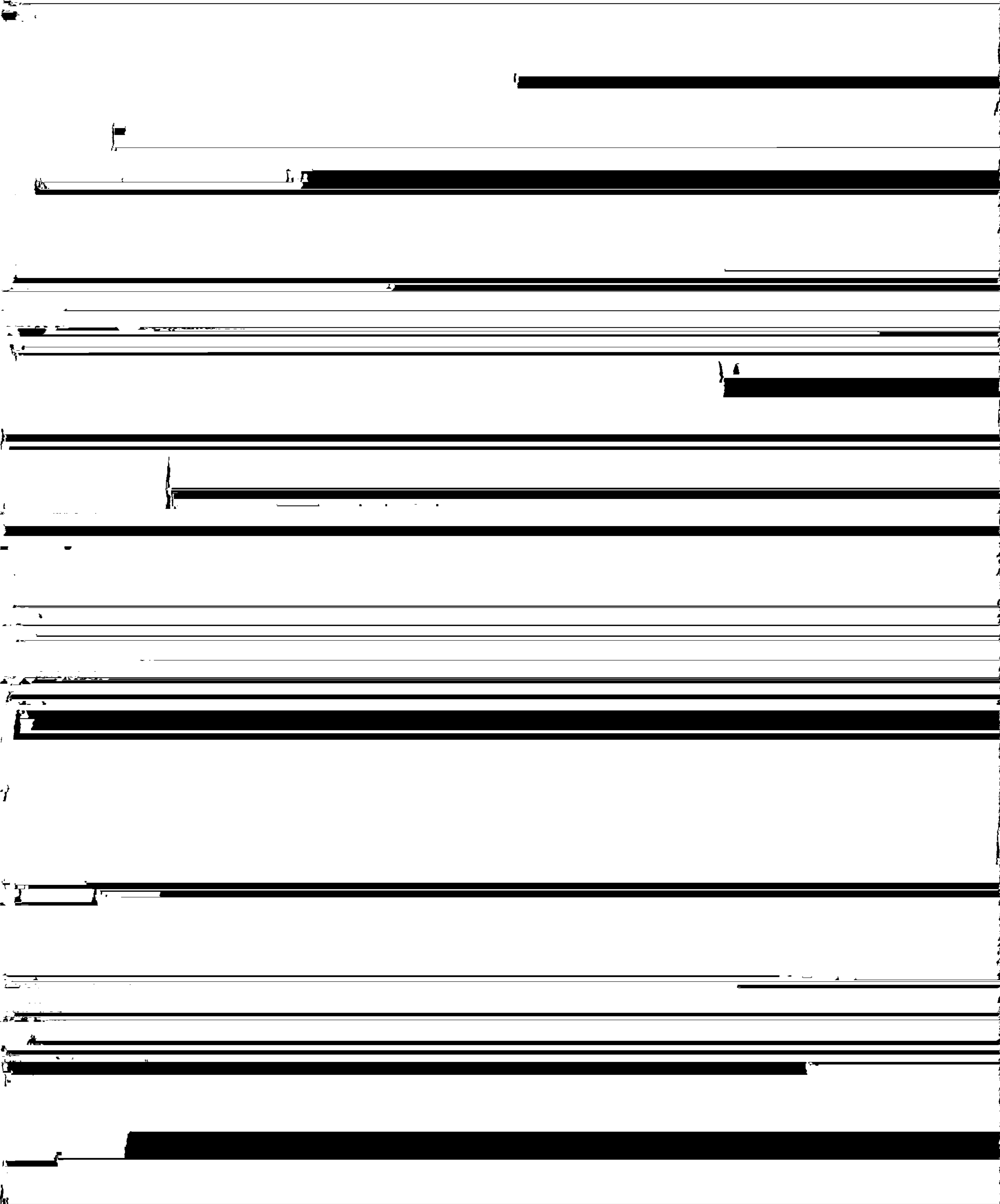
FIG. 1 is a pictorial schematic depicting four support

The objects and features of the present invention will be better understood in view of the following description taken in conjunction with the drawings wherein: